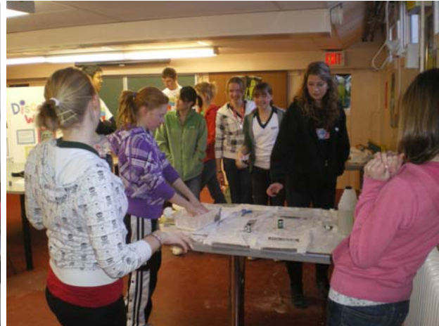
Pathfinders Exploring Magnet Magic

Visit http://getset-2010.weebly.com/index.html (that is a hyphen) for Tech Tour info. Your Leader can book a tour. Booking window: Feb 23 - Mar 2, 9am to 9pm.